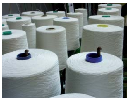
Mitsubishi frequency inverter drives are now standard equipment in the textile industry.

Improvements include an integrated USB port, an integrated one-touch Digital Dial control with a display, improved power usage at low speeds and an expansion slot compatible with the many option cards from the 700 series. All this makes the FR-E700 SC an economical and highly-versatile solution for a wide range of applications from textiles machines to door and gate drive systems to material handling systems.