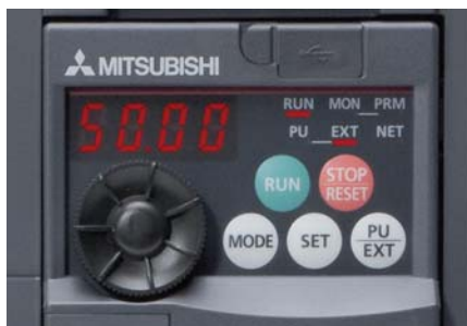
The installed Multi User Panel with the Digital Dial

The integrated control unit with the one-touch Digital Dial gives the user direct access to all important parameters – much more quickly than would be possible with normal keys.