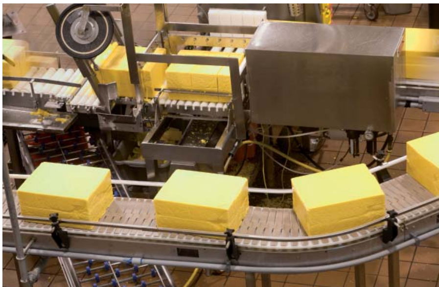
Material transport systems like this example in a printing works are just one of the many applications for the FR-E700 SC