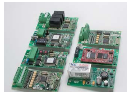
Option cards for additional functions

Functions can be added with option cards and additional I/O modules to configure the system for individual applications and requirements.